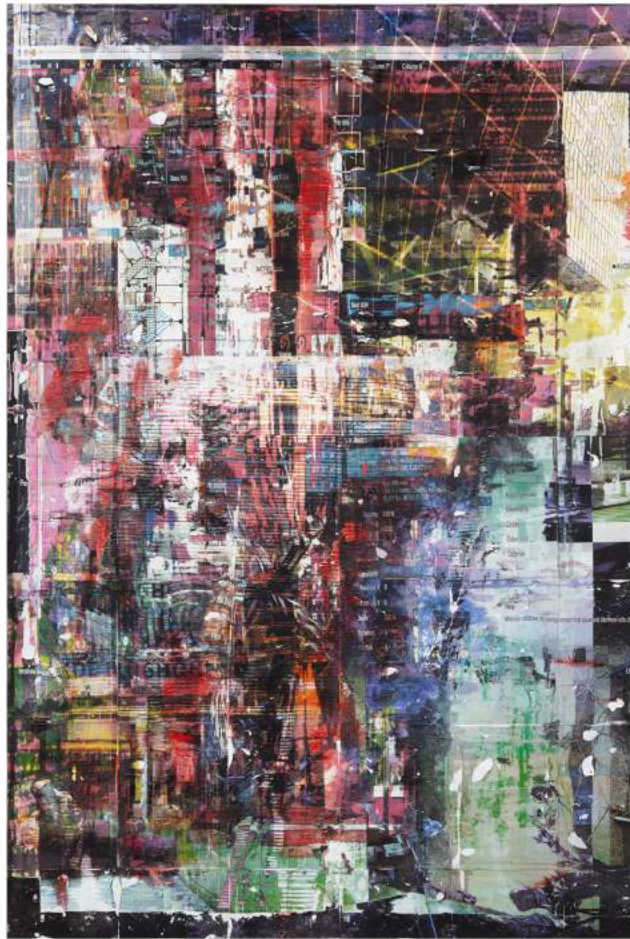
Untitled (Bleeding Edge) , 2020, acrylic polymer, pigment, ink, gesso, UV coating on linen, 173 × 117 cm

The future is here, and it is nostalgic for the past that imagined it.