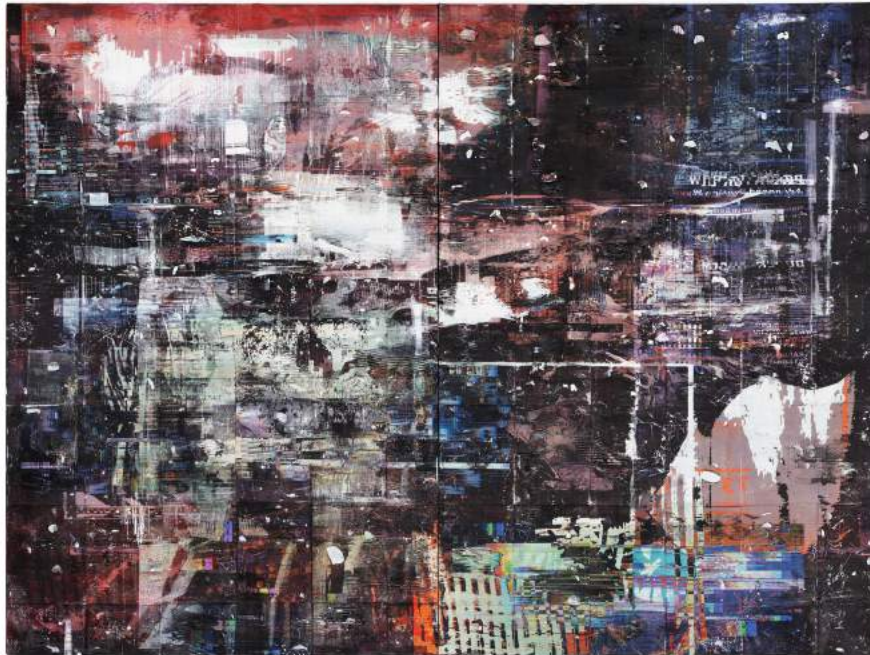
Untitled (Leviathan II) , 2020, acrylic polymer, pigment, ink, gesso, UV coating on linen, 160 × 234 cm

Cyberpunk worlds tend to take place in a more extreme version of the present.