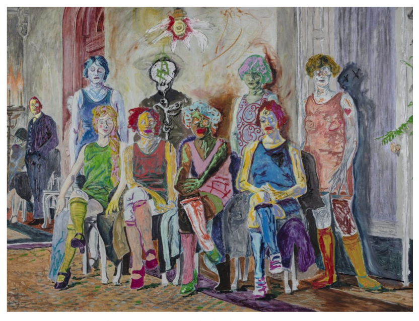
Farley Aguilar, The Women, 2018; oil, oil stick, graphite on linen; 69 x 91 inches

Contributed by Sharon Butler / Farley Aguilars paintings, on view at Lyles & King, are based on vintage photographs of 1920s and 30s seaside beauty pageants and images of female Nazi collaborators having their heads shaved after World War II. The contrast is jarring at first but fits into an insightfully integrated sense of powerlessness in the face of cruel political upheaval and human objectification across a broad spectrum of circumstances.