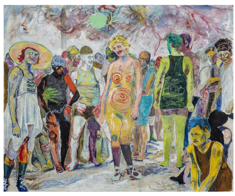
Farley Aguilar, The Beach, 2018; oil, oil stick, graphite on linen; 76 x 92.5 inches

Contributed by Sharon Butler / Farley Aguilars paintings, on view at Lyles & King, are based on vintage photographs of 1920s and 30s seaside beauty pageants and images of female Nazi collaborators having their heads shaved after World War II. The contrast is jarring at first but fits into an insightfully integrated sense of powerlessness in the face of cruel political upheaval and human objectification across a broad spectrum of circumstances.