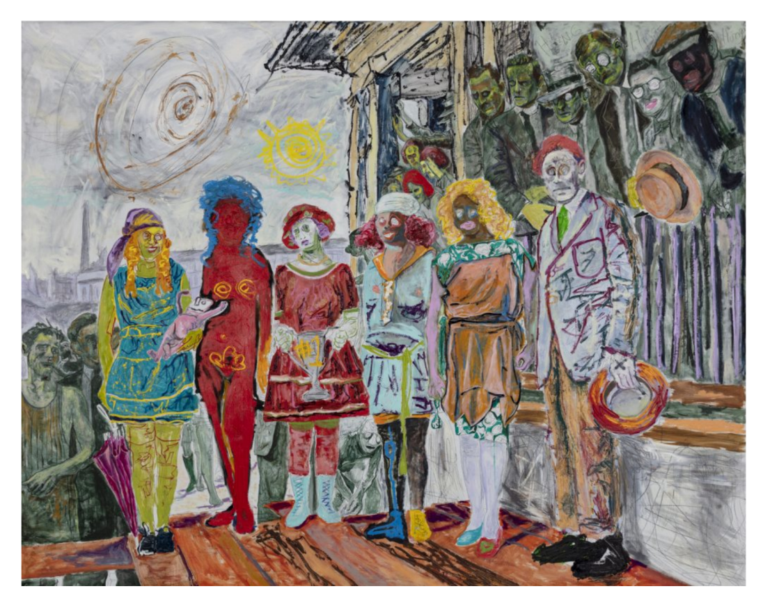
Farley Aguilar, Beauty Contest, 2018; oil, oil stick, graphite on linen; 76 x 97.5 inches

On close examination, the images suggest that Aguilar, who is self-taught, sketches them in pencil on the canvas and then scribbles crudely around the pencil lines with oil sticks and paint. The drawing provides rough structure for each scene, but it is the color, garish and calibrated to shrill, that carries the screamingly urgent emotional content. Aguilar channels the same faux-comic despair of Nicole Eisenman, Peter Saul, and George Condo but with less focus on expanding traditional painterly chops. Collectively, the nine large-scale canvases constitute an unsettling spectacle of how callously, even monstrously, human beings behave.