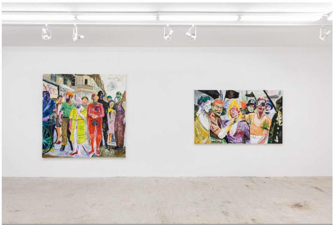
Farley Aguilar, installation view