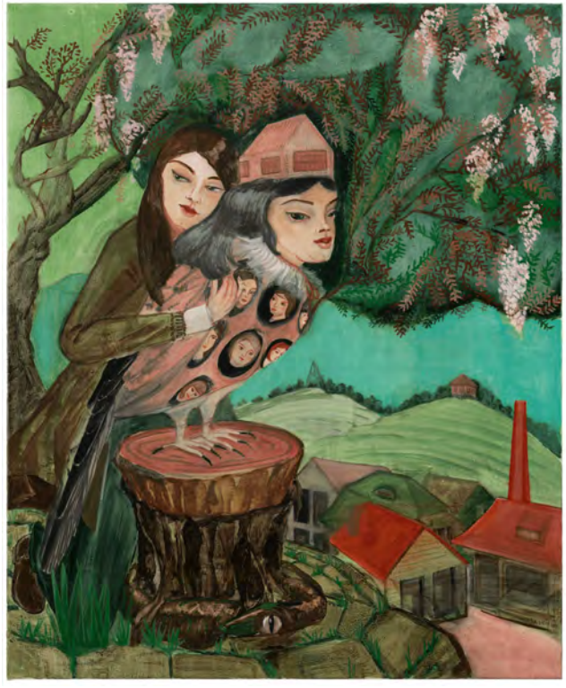
My Dear Chimera, 2020, Casein on canvas, 43 1/4 x 35 3/8 inches, Courtesy of the Artist and Lyles & King

Casein is odorless and easy to mix. It's also easy for me to handle. It's leaner than oil paint. So I can still paint on casein with the oil paint go on it