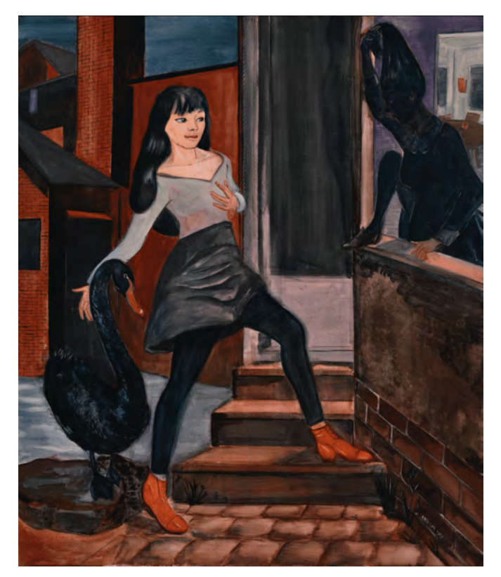
Night in the Hair, 2020, Casein on canvas, 51 1/8 x 43 1/4 inches, Courtesy of the Artist and Lyles & King