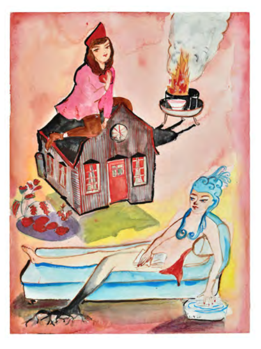
Elements, 2020, Watercolor on paper, 12 1/4 x 9 1/8 inches, Courtesy of the Artist and Lyles & King

My pictures do not relate directly to art historical references or colleagues. I live in an area ofCentral Europe that has had a strong cultural tradition in many areas for centuries. This cultural humus naturally has an indirect influence on my work.