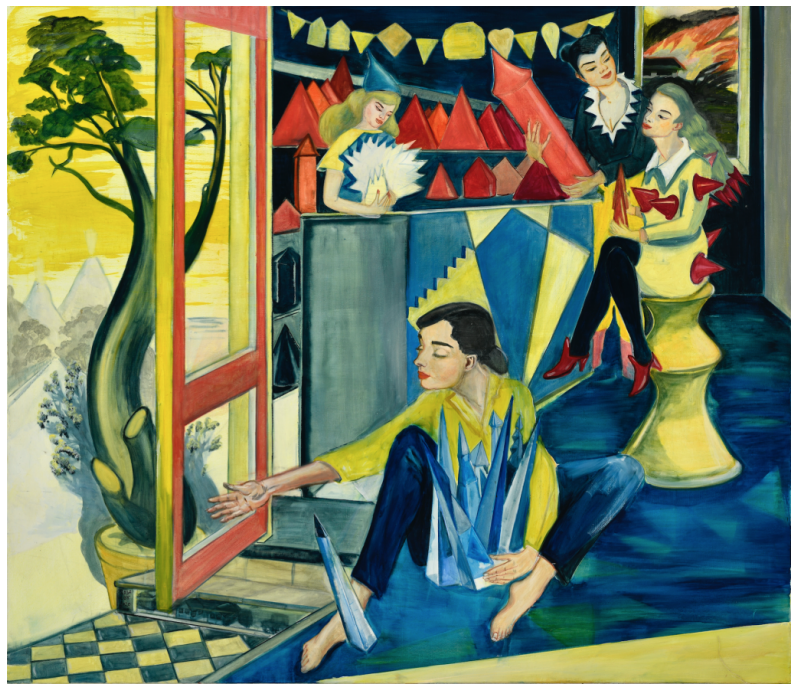
Chic, 2020, Casein on canvas, 51 1/8 x 59 1/8 inches, Courtesy of the Artist and Lyles & King

In my experience, a daily routine is extremely beneficial to my work. I start painting around 10 a.m., then 12-13.30 p.m. lunch break, reading, emails. Then another two hours at the easel, drinking coffee at 4pm and working until 6pm.