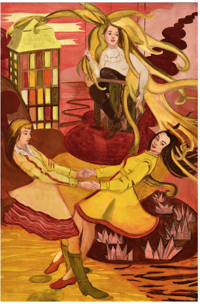
In the Air, 2020, Casein on canvas, 59 1/8 x 39 3/8 inches, Courtesy of the Artist and Lyles & King

Most of the time I start with a thought note. I often think in pictures, so it's easy to sketch something. Many small ideas lead to a picture. It is important that these ideas are available at a certain point in time.