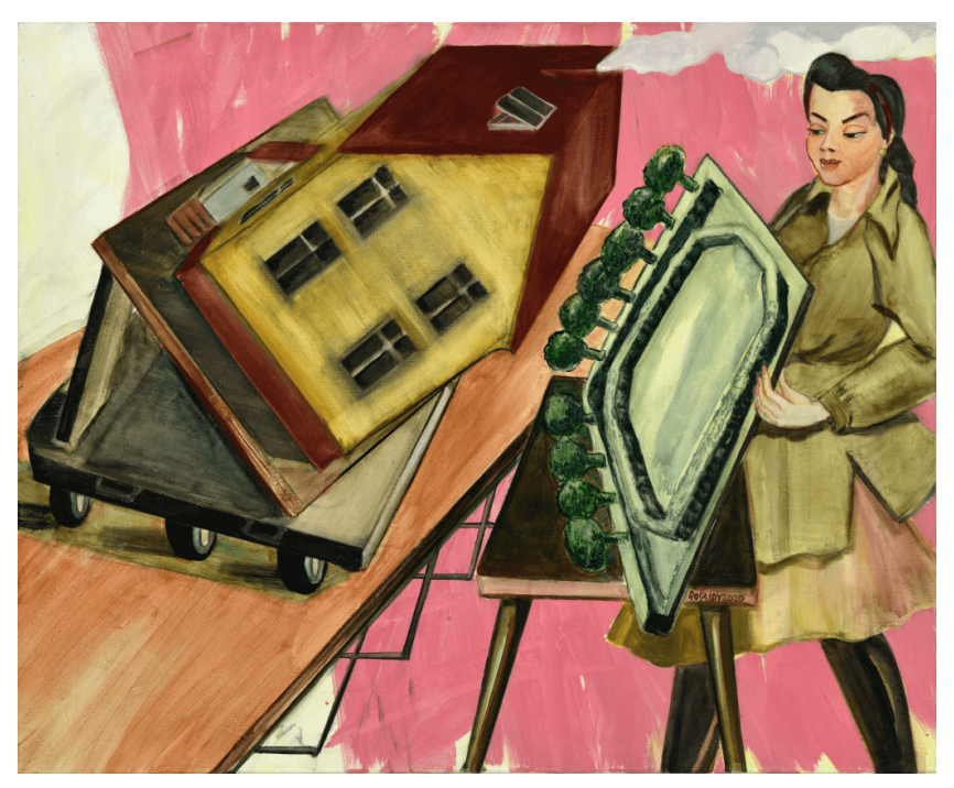
Move, 2020, Casein on canvas, 35 3/8 x 43 1/4 inches, Courtesy of the Artist and Lyles & King

There was a short time when I tried to paint abstractly. That was totally unsatisfactory. I felt dishonest