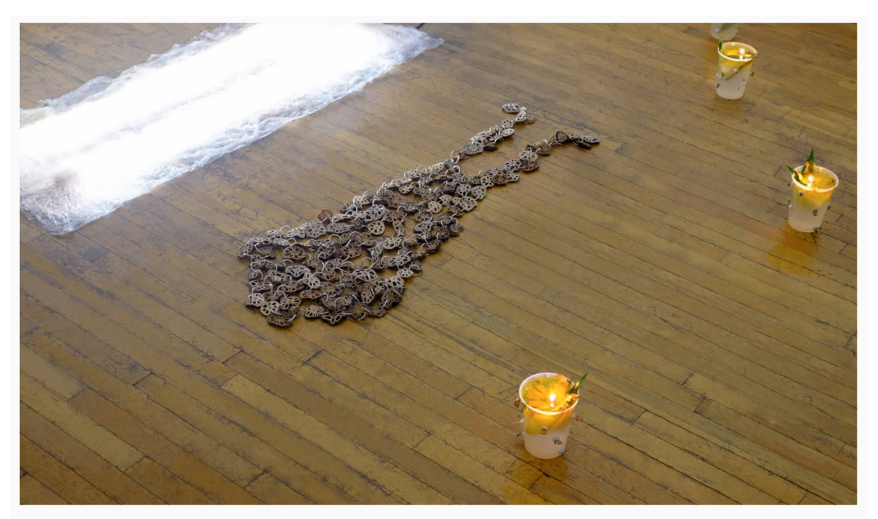
Catalina Ouyang, Untitled, 2018, Dehydrated lotus root, binder rings, saran wrap, fluorescent lights, takeout containers, epoxy clay, ginger, water, lilies, olive oil, beeswax, cotton twine, beach pebbles, Dimensions variable.

sexual commodification dating from ancient times, as seen in the burning body, to present day, as seen from the pop culture reference of the Pretty Woman script recitation.