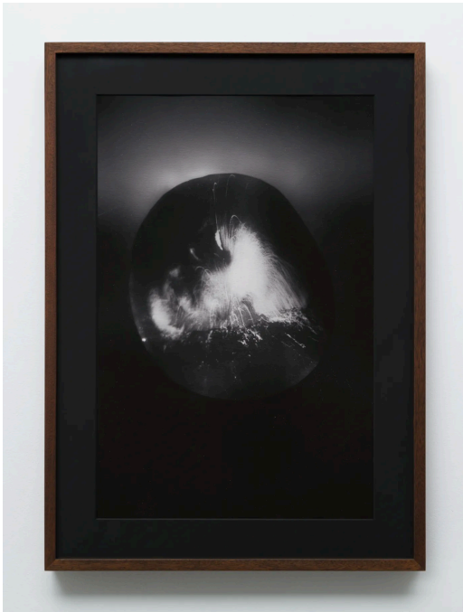
Shala Miller Becoming Obsidian, 2023 Archival pigment print on William Turner paper 20 x 16 inches, 50.8 x 40.6 cm Edition of 2 + 1 AP

The exhibit discussed in the interview is at Lyles & King .