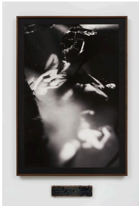
Shala Miller Modern Day Sisyphus I, 2023 Archival pigment print on William Turner paper, hand engraving on lava stone 48 x 28 inches, 121.9 x 71.1 cm Edition of 2 + 1 AP