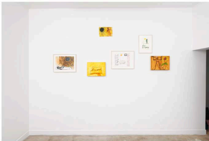
Installation view of Mira Schor, 'Orbs and eclipses', Marcelle Alix, Paris, 2022.